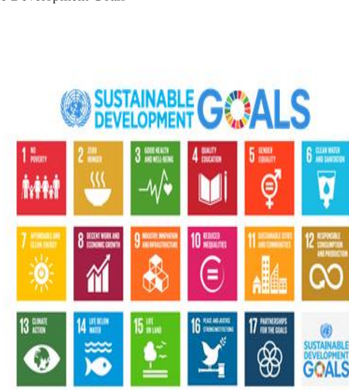
Figure 3: Sustainable Development Goals

The world is implementing the Sustainable Development Goals to be attained by the year 2030. The 17 Goals (SDGs) was established by member countries to advance the development framework beyond 2015.