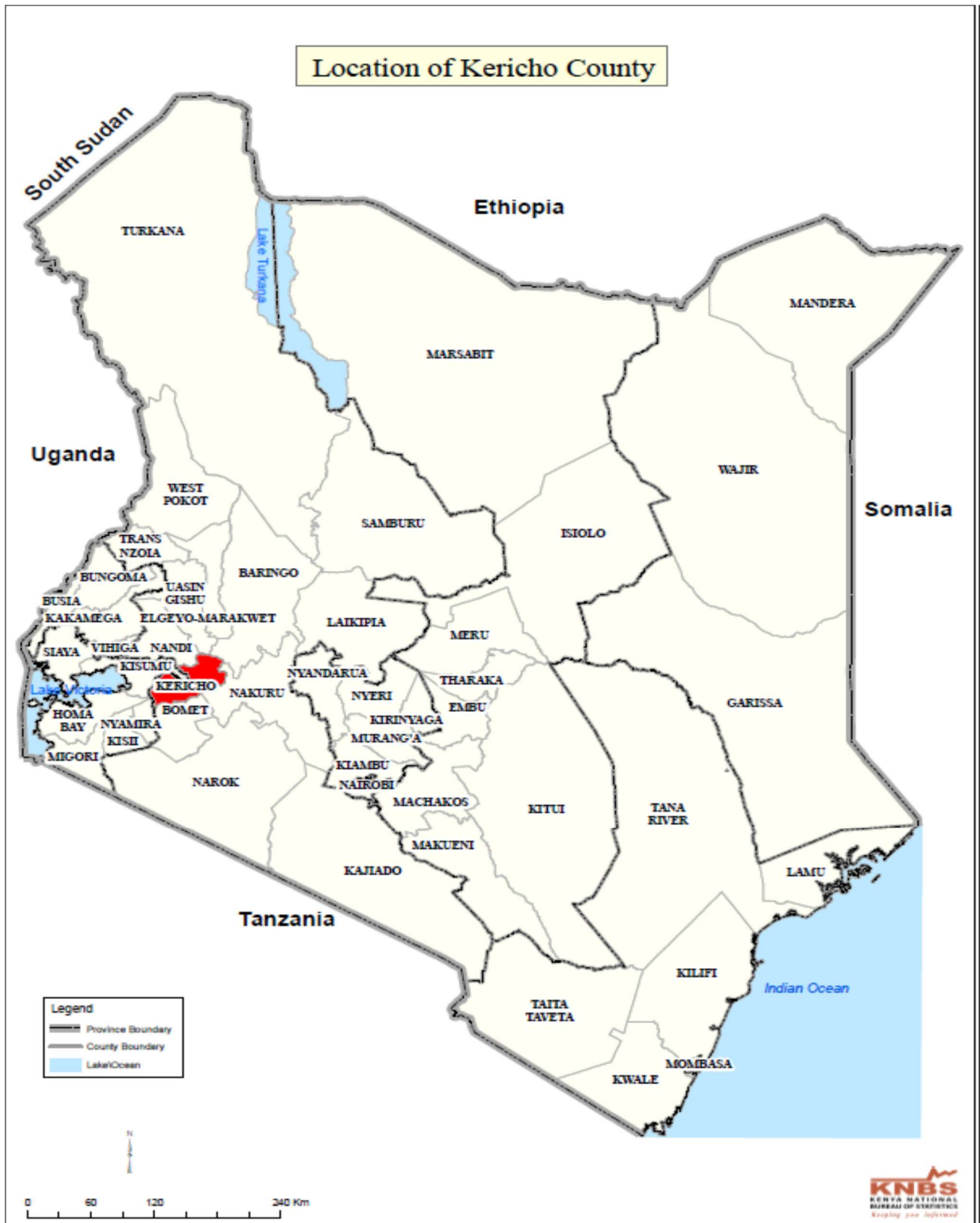
Map 1: Location of the Kericho County in Kenya